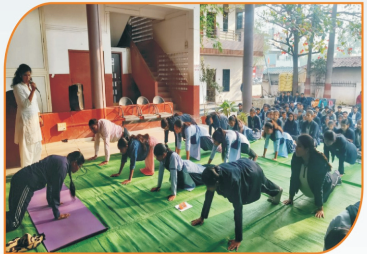
YOGA DAY 2025