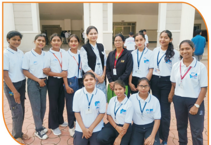
CAREER SANSAD AT BARAMATI-2025