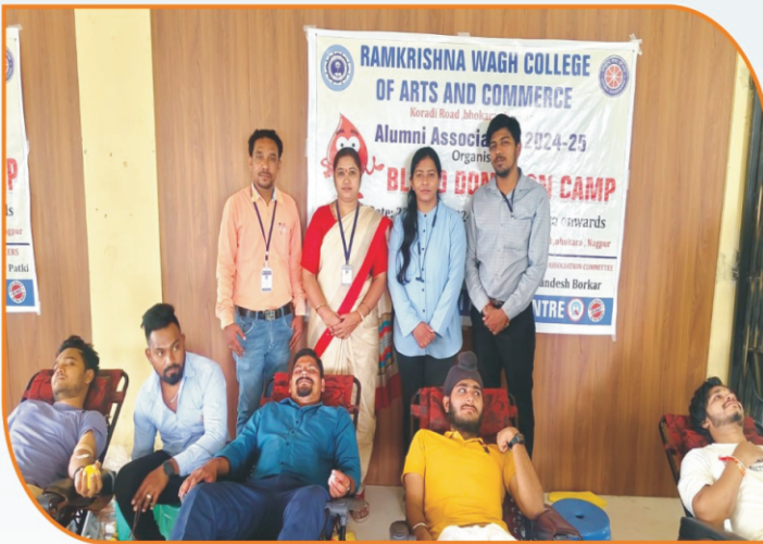
BLOOD DONATION CAMP BY ALUMNI