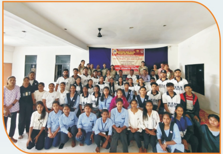
NSS CAMP 2025 HELD AT PATANSAONGI