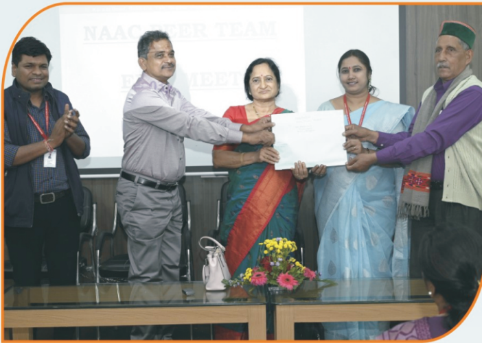
NAAC PEER TEAM VISIT